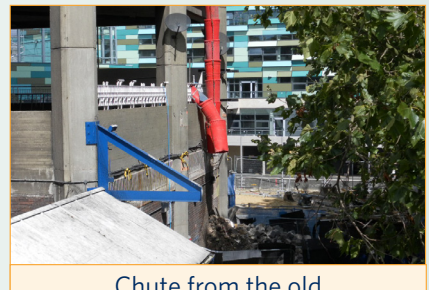
Chute from the old Social Services office